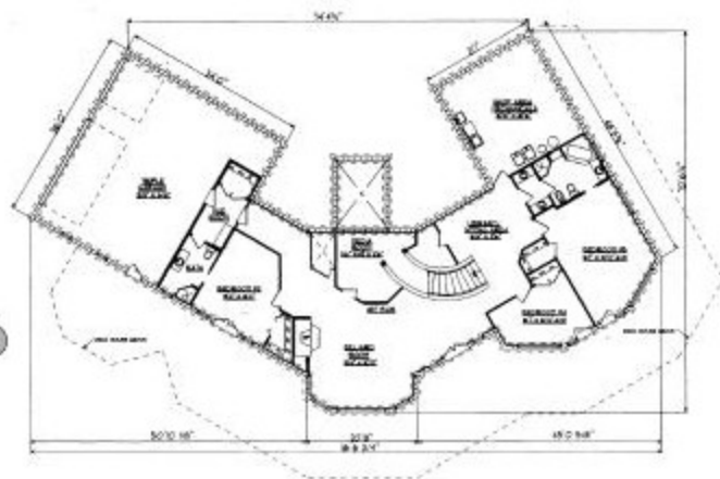
basement floor plan

total floor living area ..... 4102 sq.ft. basement area ..... 3064 sq.ft. garage area ..... 1006 sq.ft.